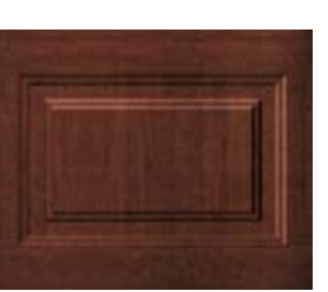
Classic Cherry Finish