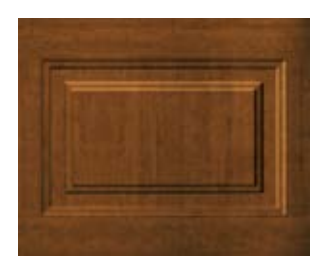
Classic Medium Finish